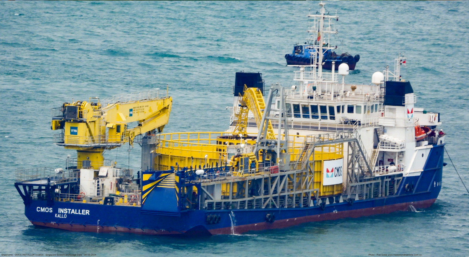
Shipsname - CMOS INSTALLER location - Singapore Eastern anchorage Date - 09-05-2024